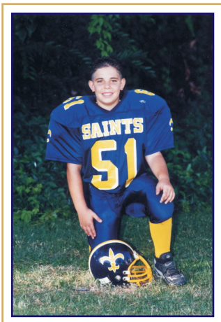
Retired #51 Jersey